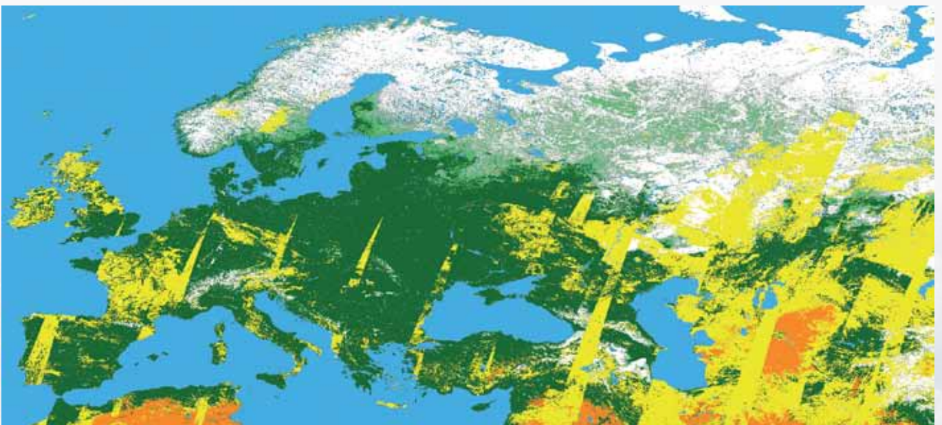
An experimental aggregated Fractional Snow Cover (FSC) product including all satellite passes within a given time period. This product of 8 April 2004 covers all observations the last ten days.

The GlobSnow SE product is a 'first-time endeavour' for the remote sensing community in Europe. Such a high spatial resolution time series of snow products of global coverage has never been produced before.