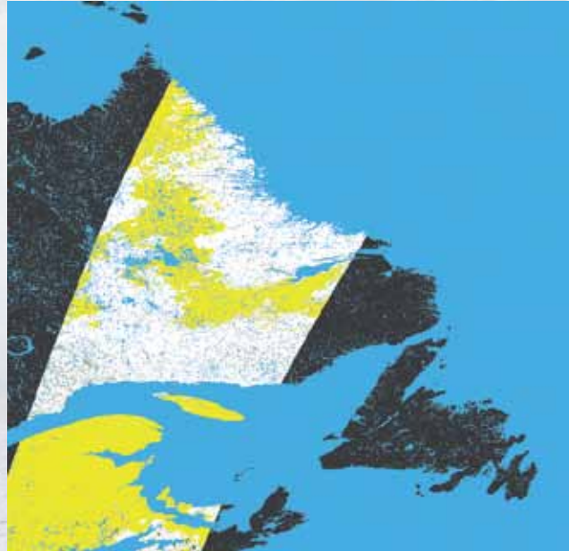
Sample Glob-Snow SE prototype products have been produced for Labrador, Canada, as well. This example of a day product is from 1 April 2004. Clouds are shown in yellow.

first user Workshop. We expect to receive recommendations and requests from the user community based on the prototype products and the work conducted so far by the consortium.