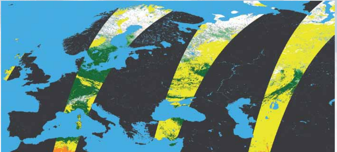
Example of the daily Fractional Snow Cover (FSC) L3A product, 1 April 2004. The green-to-white colour nuances represent the snow fraction (%) per grid cell (from bare ground to full snow cover, respectively). Clouds are shown in yellow and anomalous satellite data in orange. The product includes all satellite overpasses of the day.

approach to global SE mapping). Three evaluation sites were chosen in order to cover the most important nature types and variability. These sites were Norway (high-mountain terrain, not alpine), the Alps (alpine terrain) and Finland (boreal forest and some open plains). Comprehensive reference data were available for the three sites. For the mountain sites, the reference data were mainly semi-automatically and separately validated high-resolution snow maps based on Landsat TM or ETM+