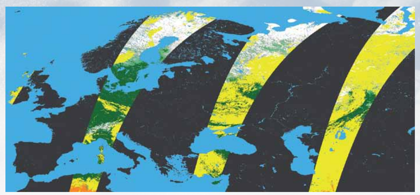
Example of the daily Fractional Snow Cover (FSC) L3A product, 1 April 2004. The green-to-white colour nuances represent the snow fraction (%) per grid cell (from bare ground to full snow cover, respectively). Clouds are shown in yellow and anomalous satellite data in orange. The product includes all satellite overpasses of the day.

approach to global SE mapping). Three evaluation sites were chosen in order to cover the most important nature types and variability. These sites were Norway (high-mountain terrain, not alpine), the Alps (alpine terrain) and Finland (boreal forest and some open plains). Comprehensive reference data were available for the three sites. For the mountain sites, the reference data were mainly semi-automatically and separately validated high-resolution snow maps based on Landsat TM or ETM+