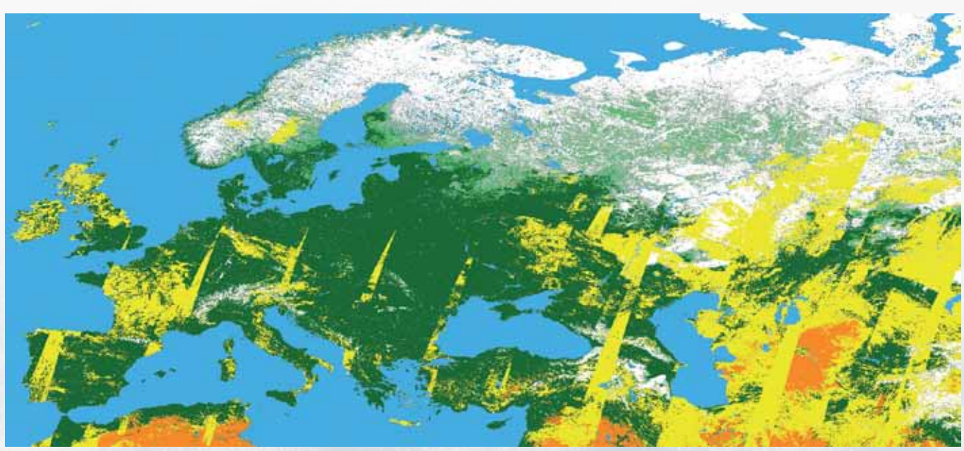
An experimental aggregated Fractional Snow Cover (FSC) product including all satellite passes within a given time period. This product of 8 April 2004 covers all observations the last ten days.

The GlobSnow SE product is a 'first-time endeavour' for the remote sensing community in Europe. Such a high spatial resolution time series of snow products of global coverage has never been produced before.