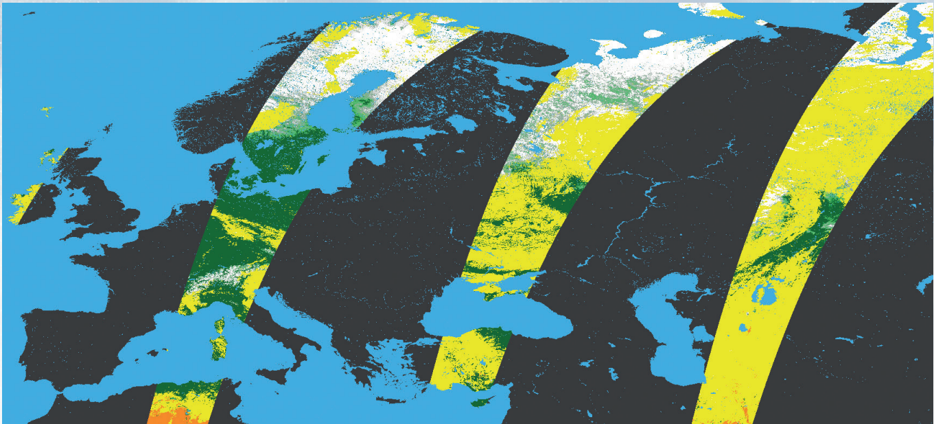
Example of the daily Fractional Snow Cover (FSC) L3A product, 1 April 2004. The green-to-white colour nuances represent the snow fraction (%) per grid cell (from bare ground to full snow cover, respectively). Clouds are shown in yellow and anomalous satellite data in orange. The product includes all satellite overpasses of the day.

approach to global SE mapping). Three evaluation sites were chosen in order to cover the most important nature types and variability. These sites were Norway (high-mountain terrain, not alpine), the Alps (alpine terrain) and Finland (boreal forest and some open plains). Comprehensive reference data were available for the three sites. For the mountain sites, the reference data were mainly semi-automatically and separately validated high-resolution snow maps based on Landsat TM or ETM+