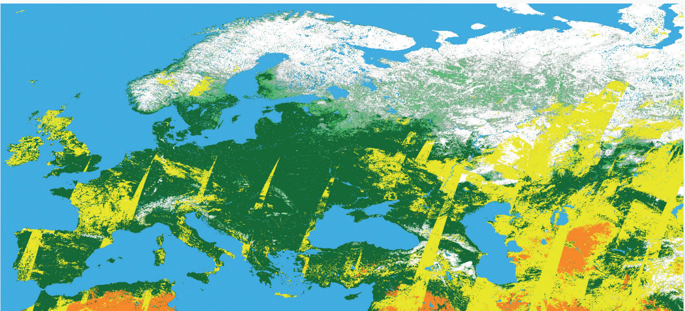
An experimental aggregated Fractional Snow Cover (FSC) product including all satellite passes within a given time period. This product of 8 April 2004 covers all observations the last ten days.

The GlobSnow SE product is a 'first-time endeavour' for the remote sensing community in Europe. Such a high spatial resolution time series of snow products of global coverage has never been produced before.